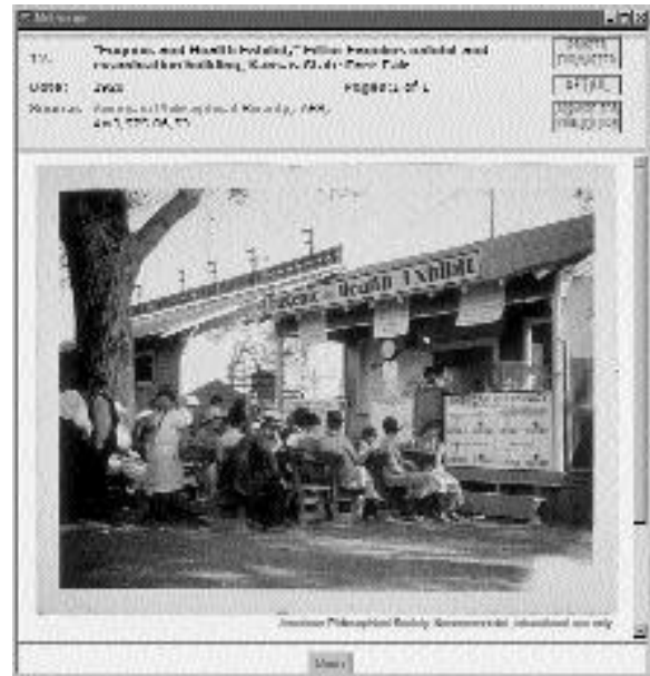
The Eugenics Archive home page (left) includes links to “virtual exhibits” that provide context for the 1200 images in the Archive . The image window (above) provides basic information about the image, a link to a higher resolution “detail” image, access to source archives for use permissions, and a printer-formatted page.

standards. In November, the Archive was the subject of a feature article in the popular online magazine Salon ( http://www.salon.com/tech/feature/1999/11/17/eugenics/index.html ).