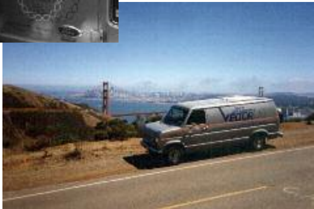
The Vector Van approaching the Golden Gate Bridge in San Francisco.

In 1986, we obtained funding from Citibank to develop a mobile “Vector Van”—a Ford Econoline with a silver paint job and loaded to the ceiling with pipettes, centrifuges, and water baths. With independent funding from small foundations and biotech start-ups, we took our DNA show on the road, conducting week-long teacher workshops at six sites across the United States. On the last leg of the trip—from Milwaukee, Wisconsin, to Davis, California—the Vector Van was piloted by a German graduate student who had just received her driver’s license, with a high school intern as copilot. That same year, we initiated a cooperative agreement with Carolina Biological Supply Company to develop reagents and kits to accompany the DNA Science curriculum.