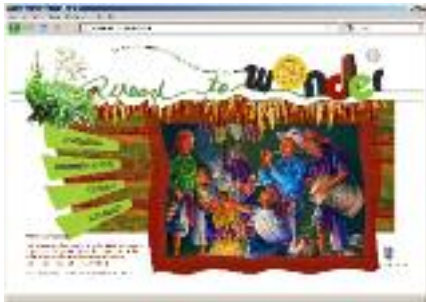
The Weed to Wonder site will explore how humans change corn and how corn changed human society.

scientists at Cornell University. Under this project, the DNALC will develop a multimedia internet site, Weed to Wonder . We will tell the remarkable story of the corn plant's amazing rise—from a common weed, to staple food and religious icon of Native Americans, to modern hybrid cultivar, to versatile and ubiquitous component of processed food, to precursor of clothing and motor fuels, to pharmaceutical factory. Weed to Wonder will celebrate this uniquely American success story and provide a case study of the interaction among science, technology, and society (STS). The site will open an internet window on modern research on plant genomes, as well as a time machine back into the social and scientific history of agricultural breeding. The goal will be to show the continuity of research on corn—from Native American agriculturalists to agricultural breeders, corn geneticists,